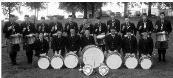
SFU Drum Corps - World Champions