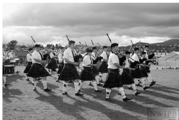
Northwest Junior Pipe Band - at Worlds