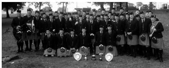
SFU Pipe Band - World Champions

Novice. The Keith Highlanders were third in Grade 4B. And the White Spot Pipe Band was sixth in Juvenile. The BCPA extends congratulations to all competing bands. Full results are available on the RSPBA Website.