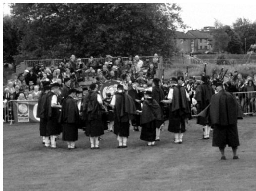
White Spot Pipe Band - at the Worlds