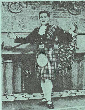
BOBBY HARVEY The Prince of Violin

CALUM KENNEDY Scotland's foremost Singing Star